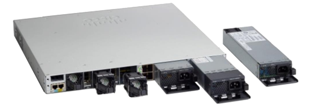
Figure 4. Cisco Catalyst 9300 Series Dual Redundant power supplies

Cisco Catalyst 9300 Series switches support dual redundant power supplies. The switches ship with one power supply by default, and the second power supply can be purchased when the switch is ordered or at a later time. If only one power supply is installed, it should always be in power supply bay #1. The switches also ship with three field-replaceable fans. Power Supplies are common across the Catalyst 9300 Series.