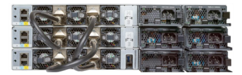
Figure 6. Cisco Catalyst 9300 Series fixed uplink models with optional stack kit