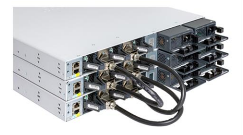
Figure 5. Cisco Catalyst 9300 Series modular uplink models stack (C9300/C9300X SKUs) and fixed uplink models stack (C9300L SKUs)