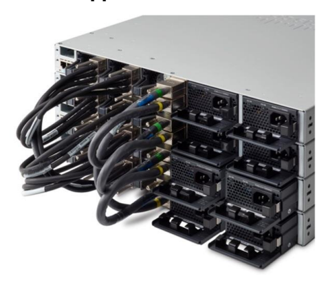
Figure 7. Cisco Catalyst 9300 Series StackPower